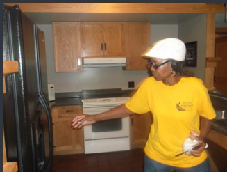
Great Indoor and out door fun!