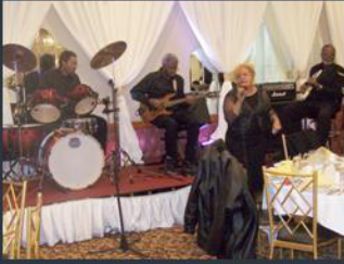
Brothers Choice Band at BCAA 2015 Banquet