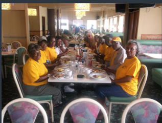
Lake Shakamak, Indiana