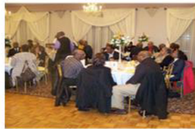
Big Catch Angler Associations Members

The Big Catch Angler 10 th Annual Awards Banquet was a great success. We had just over 90 people in attendance with the food and music providing an exquisite complement. With soulful blues and Jazzy sounds, of The Choice Brother's Ensemble, anglers not only celebrated their year 2014 achievements, they also displayed some pretty serious dance moves. I won't name any people but some boogies, foxtrots and the likes were indescribable.