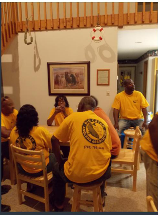
Lake Erie Walleye fishing trip