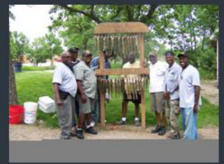
North Dakota Fishing Trip